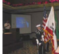
Opening Color Guard