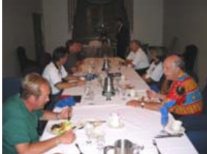
State Board Dinner